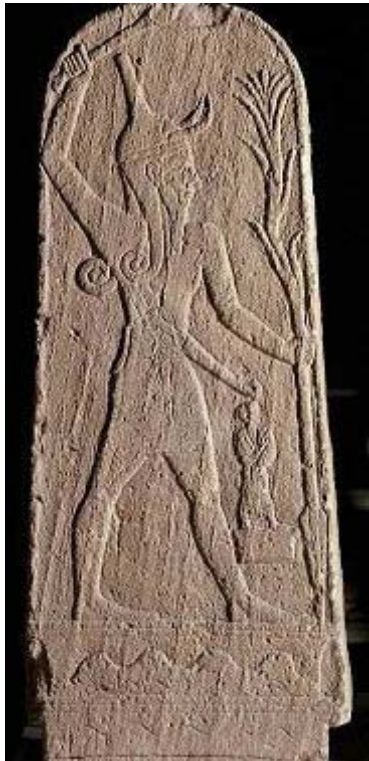
Baal Creating Ugarit 1700-1300 B.C.E. Limestone, 142x50 cm Louvre Museum