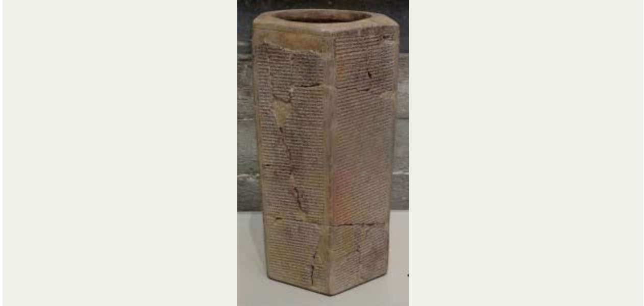
The Sennacherib Prism on display in the Israel Museum in Jerusalem.

On the six-sided clay prism called the Sennacherib Prism as well as other annals of the Assyrian king, Sennacherib details in Akkadian his successful campaigns throughout Judah, bragging that he had Hezekiah trapped in Jerusalem “like a bird in a cage.” According to the Bible, however, Sennacherib ultimately failed to capture Jerusalem before his death (2 Kings 19:35–37).