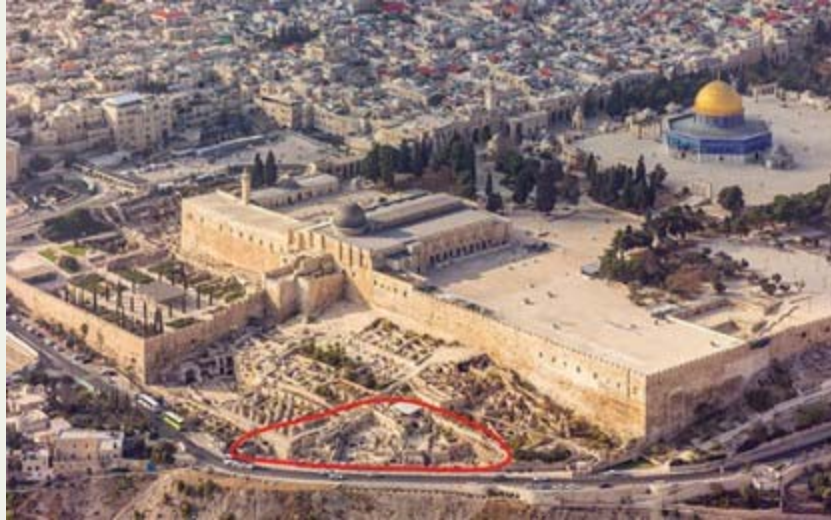
The Ophel excavation area at the foot of the southern wall of the Temple Mount in Jerusalem.