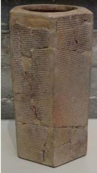
The Sennacherib Prism on display in the Israel Museum in Jerusalem.

On the six-sided clay prism called the Sennacherib Prism as well as other annals of the Assyrian king, Sennacherib details in Akkadian his successful campaigns throughout Judah, bragging that he had Hezekiah trapped in Jerusalem "like a bird in a cage." According to the Bible, however, Sennacherib ultimately failed to capture Jerusalem before his death (2 Kings 19:35–37).